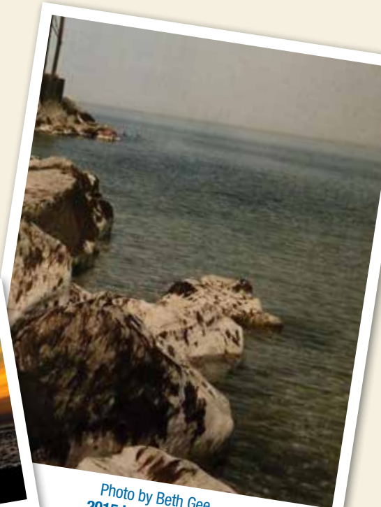
2015 Love Your Lake Photography Contest winner