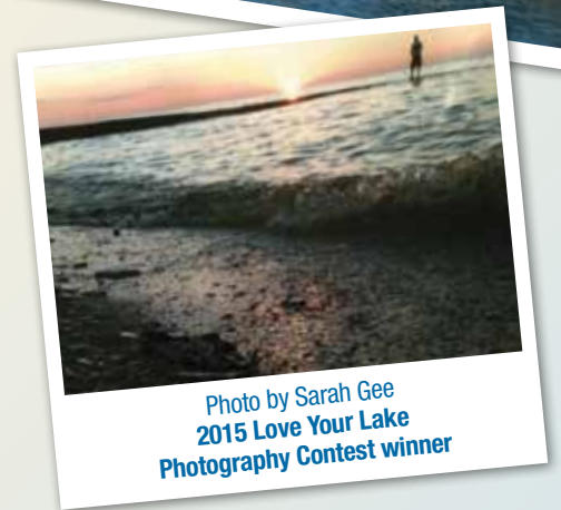
2015 Love Your Lake Photography Contest winner