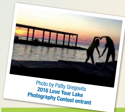
Photo by Patty Gregovits 2016 Love Your Lake Photography Contest entrant

If your home was built before 1972, you need to call us for a free inspection. You may already be in compliance, but if you aren't, we'll help get you on your way. For additional help, we have a video available at YouTube.com/avonlakewater ("This Is Why You Need to Separate"). Plus, we're instituting a loan program to help those interested in paying for their project over a longer amount of time. Call us at (440) 933-6226 or go to avonlakewater.org to learn more.