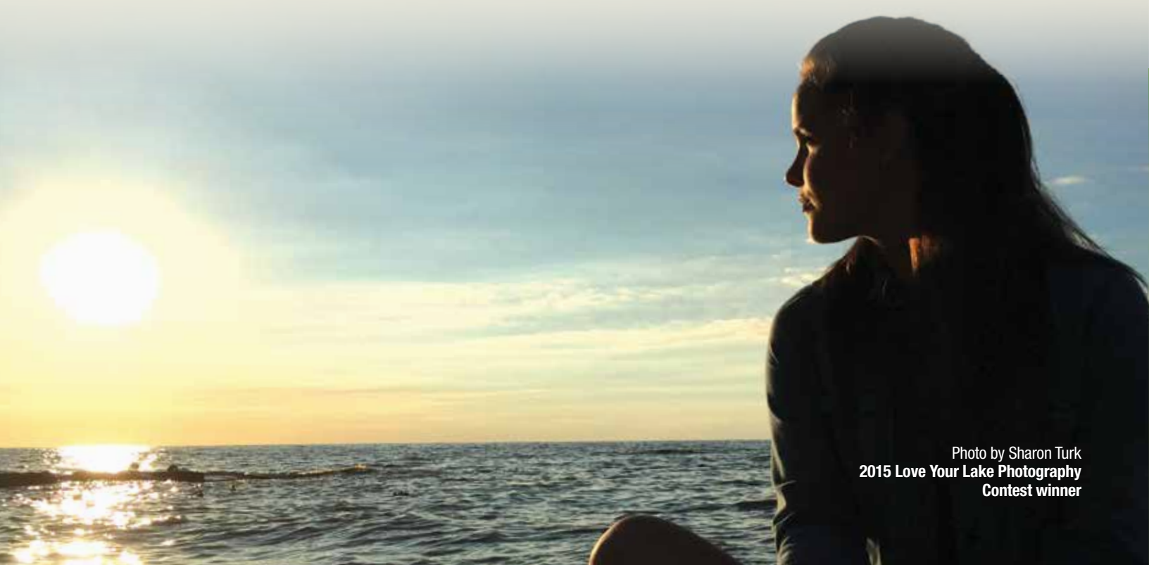
2015 Love Your Lake Photography Contest winner