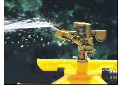
Reduce lawn irrigation by one day a week this summer to save water, money.

Water and wastewater rates go up next billing cycle. Don't worry, even when they do, you'll still pay less for a day's worth of drinking, flushing, cooking, bathing and washing for you and your family than you'd pay for a 20-ounce bottle of water at a local convenience store. But if you'd like to try and conserve a little to save the 8¢-a-day increase, try shaving about 8 minutes per day off your family's cumulative shower time.